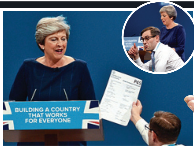
DOLE LOTTA FUN: He interrupts May's Tory speech to give her a P45